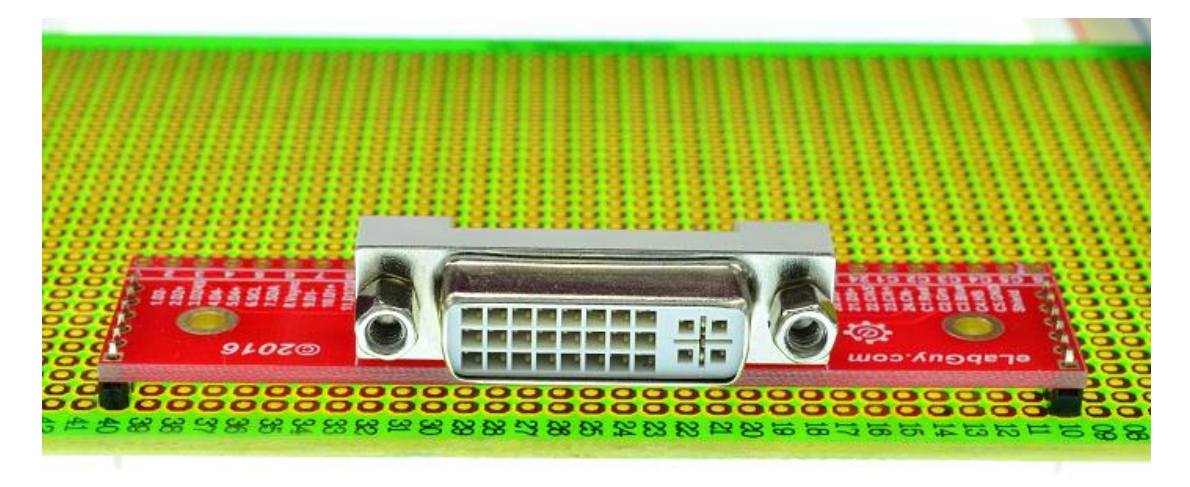
Figure 4: Solid Mounting on prototype PCB