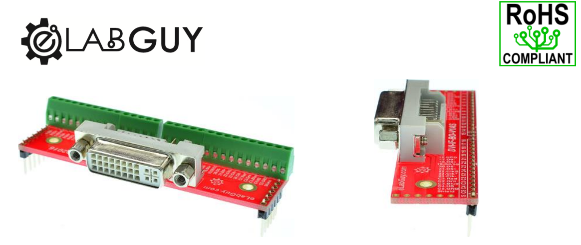
Figure 3: DVI-IF-BO-V1AS various connections